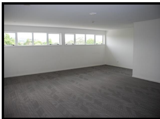
Upstairs Mezzanine Room